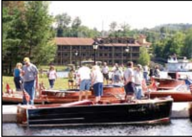
Antique Wooden Boat Show and Fulton Chain Rendezvous.