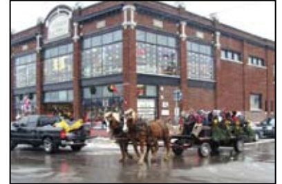
Adirondack Christmas on Main Street.