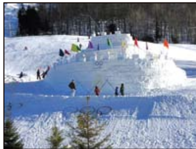
Annual Winter Carnival Weekend In Old Forge.